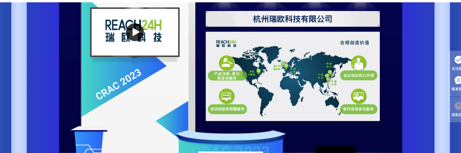
Virtual Booth on CRAC Website