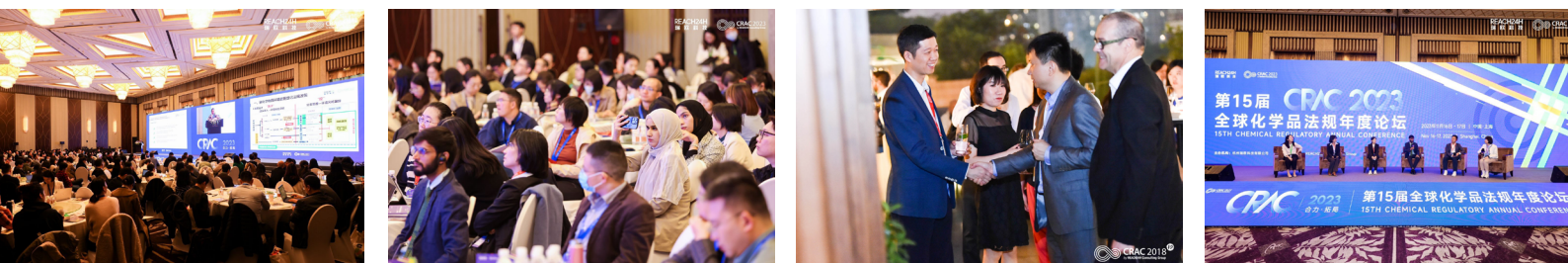
CRAC Offline Events - Sponsored Topics, Networking Dinner