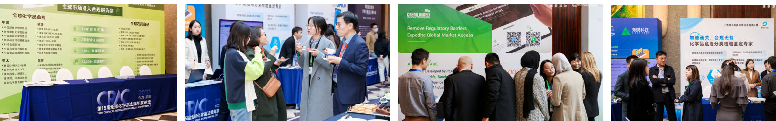
CRAC Offline Events - Exhibition and Networking