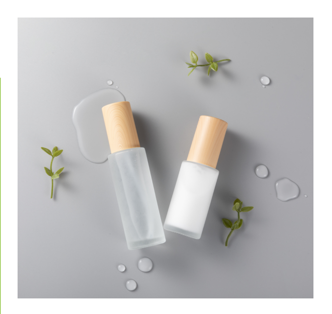
January 1, 2022

According to requirements of the National Medical Products Administration (NMPA) announcement on the implementation of Provisions for Management of Cosmetic Registration and Notification Dossiers : Beginning January 1, 2022, in accordance with the requirements of the Provisions, the registrants and filers should provide safety-related information of raw materials with functions of anti-corrosion, sunscreen, coloring, hair dye, and spot whitening when applying for registration and filing.