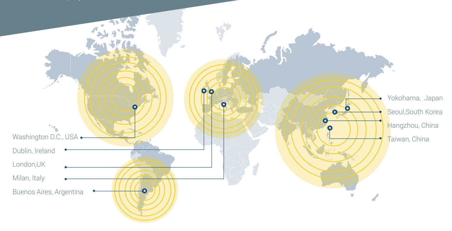
Figure 4. Global Business Layout of REACH24H